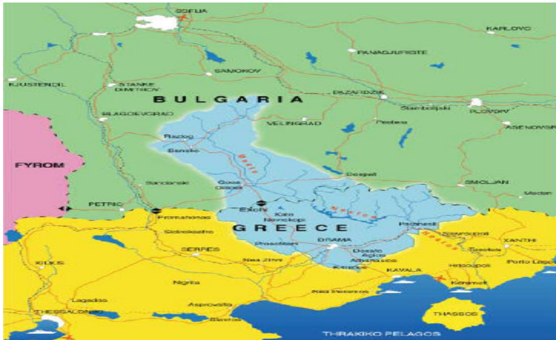
Figure 2. The The Nestos-Mesta Euroregion

gion Nestos Mesta, organised a major event in Gotze Delchev; a conference on civil society and the development of NGOs in Southern Bulgaria. The event was co-financed by the EU 'Phare-Democracy' programme.